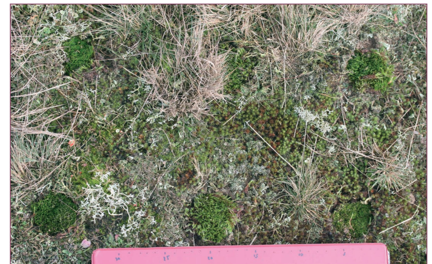
Fig. 2. Setup of an invasibility experiment in Drouwenerzand: cylinders of Campylopus are placed in a vegetation type where Campylopus would become dominant in high N-deposition areas. Plots are treated with leaf litter, and a solution of \text{NH}_4\text{NO}_3 equivalent to the highest deposition value in the country.